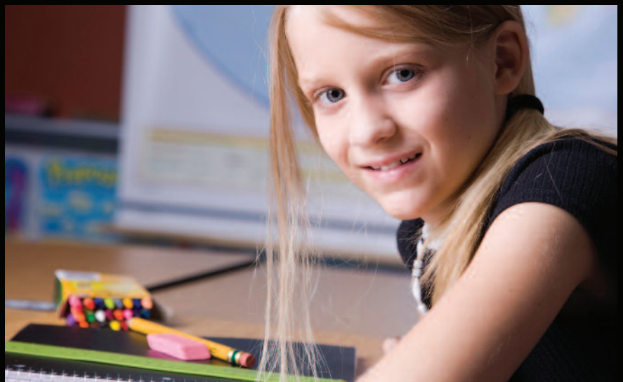
WIN supports children in need by donating school supplies to Rainbow Days .