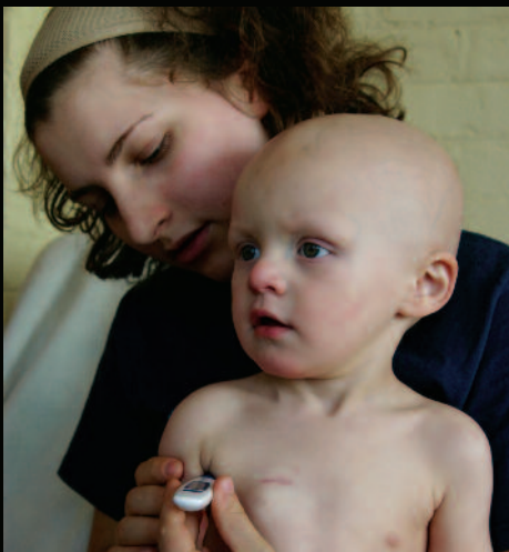
WIN is helping find a cure for cancer by supporting St. Jude Children's Research Hospital & Wipe Out Kids' Cancer .