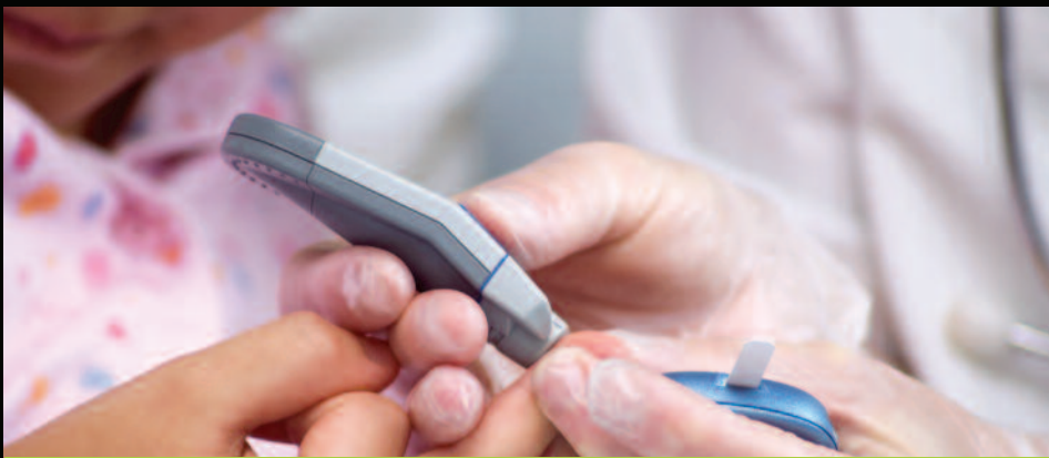
WIN was a Silver Star Sponsor at the annual Juvenile Diabetes Research Foundation Gala in 2008.

even more distributors to join in these relief efforts. For many, this proved to be a life-changing experience.