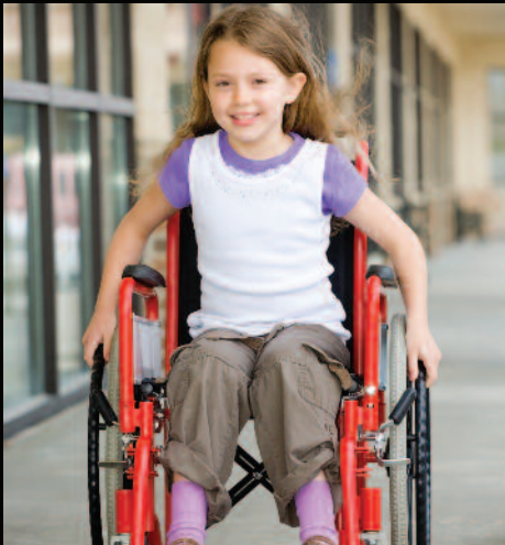
WIN Distributors have donated more than 1200 wheelchairs to the Wheelchair Foundation .

“When I give, without the expectation of receiving in return, it is invariably the time when I receive the most. ”