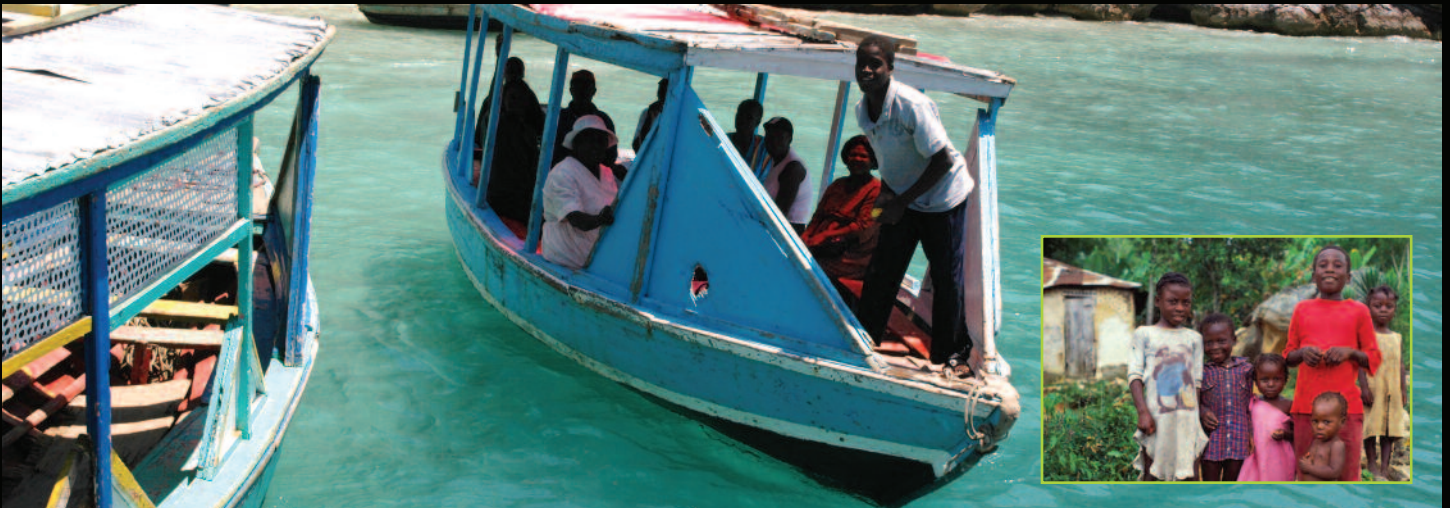
In 2009, WIN will make its third trip to Haiti, supporting the charity, Hearts Together for Haiti , with money and donated items.